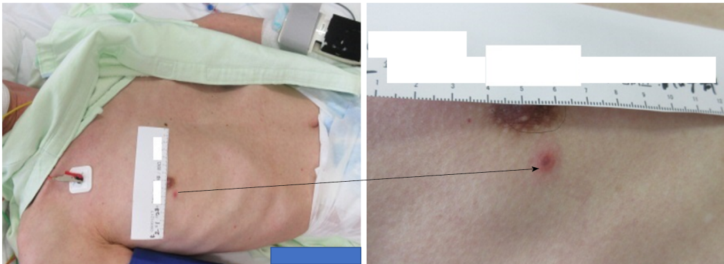
Figure 1 The skin lesion on the right chest.

CFT: Complement fixation test; HSV: Herpes simplex virus; PCR: Polymerase chain reaction; VZV: Varicella-zoster virus.