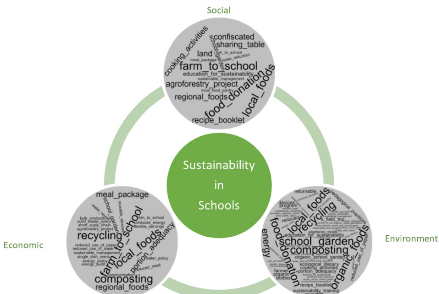
Figure 2. Identified sustainable practices in schools according to the environmental, economic, and social dimensions.

The environmental dimension of sustainability was identified in all studies that cited sustainability practices ( n = 50 ), alone (26%; n = 13 ), or together with the other considered dimensions. In most studies (44%; n = 22 ), it was possible to identify practices related to the three sustainability dimensions (environmental, economic, and social). The combination of environmental and social dimensions was identified in 14% of the studies ( n = 7 ), and the environment with economic dimension in 16% ( n = 8 ). It is important to highlight that for identifying the sustainability dimensions, some practices, in isolation, represented the attendance of more than one of the mentioned dimensions. In contrast, in other cases, the identification of different sustainability dimensions in the same study resulted from different practices cited by the authors. Sustainability practices adopted in schools are presented in Table 1. The activities were described according to the dimensions of sustainability (Figure 2).