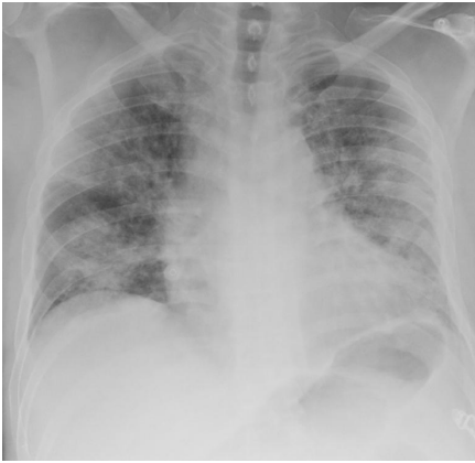
Figure 1 The Chest X-Ray demonstrates multiple bilateral peripheral predominant airspace opacities. There is no pleural effusion.