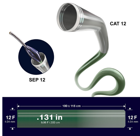
Fig. 2 Shown are the CAT 12 catheter, the Separator 12 (SEP 12), and catheter specifications.