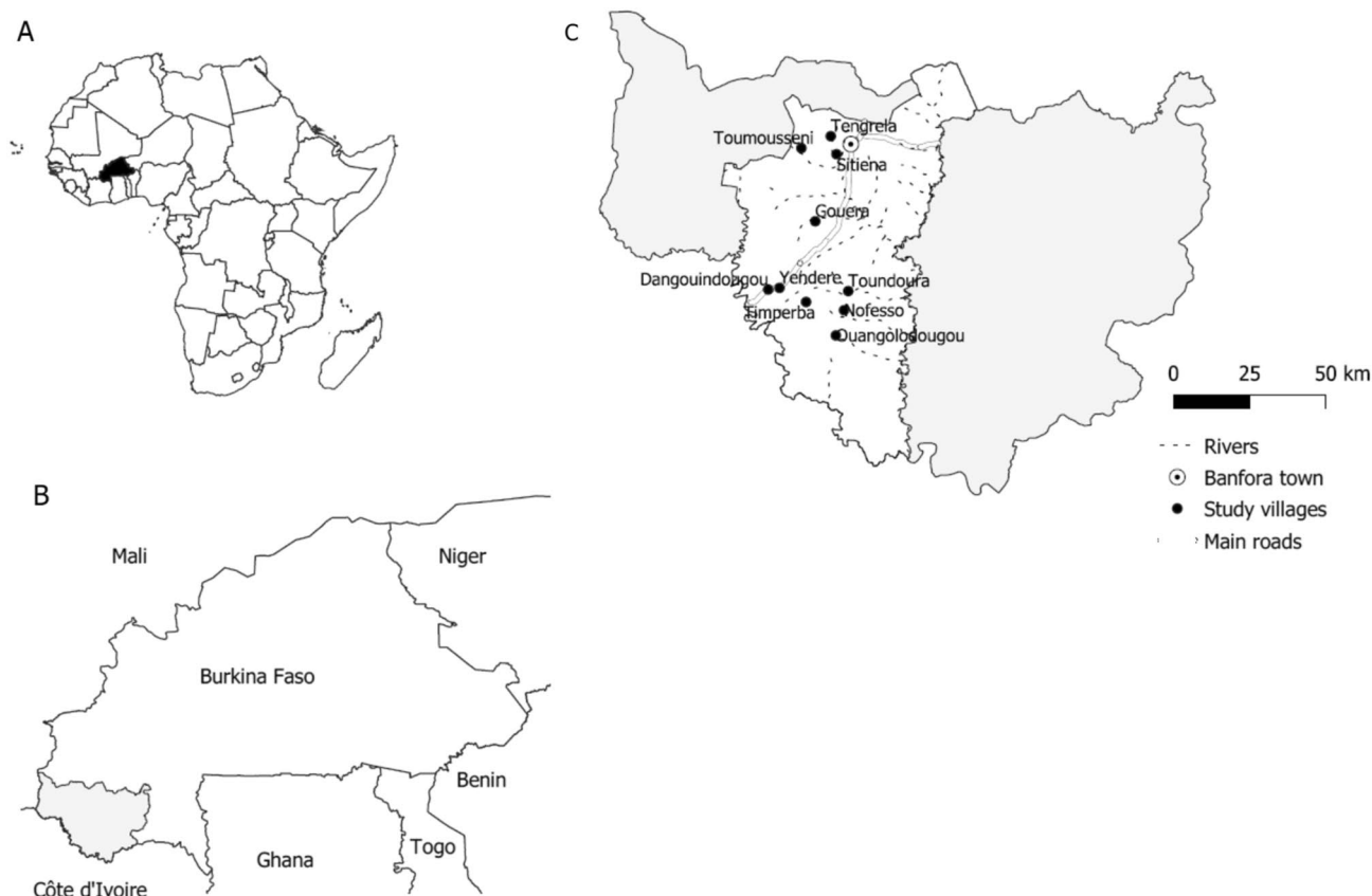
Figure 1. Map of the 10 study villages: (A) location of Burkina Faso, (B) location of Cascades Region in Burkina Faso and (C) location of Banfora Health District and study villages in Cascades Region. The map was generated using QGIS 3.16 19 . Background layers were downloaded for OpenStreetMap 20 , villages were digitised by the authors using GPS coordinates collected in the field using a GARMIN eTREX 10 GPS.

million cases in 2020, according to the National Malaria Control Programme (NMCP) 5,6 . Malaria remains the main cause of outpatient attendance at health centres in all age groups, and severe malaria was responsible for 69% of deaths in children aged 1 to 15 years in medical centres and hospitals in 2020 6 . Increases in malaria cases are being observed despite national ITN distribution campaigns in 2010, 2013, 2016 and 2019 and introduction of seasonal malaria chemoprevention (SMC) in children aged 3 to 59 months since 2014. SMC (previously termed intermittent preventive treatment in children) requires the administration of the anti-malarial drugs sulfadoxine-pyrimethamine (SP) and amodiaquine (AQ) monthly for four months during the high transmission season to prevent malaria and is recommended by WHO across the Sahel, where transmission is highly seasonal 7 . Potential explanations for the stagnating progress in malaria control include low ITN usage or lack of ITN bioefficacy and durability 8–11 , a rise in the resistance of vectors to pyrethroid insecticides used to treat ITNs 12–14 , and an increase in outdoor vector biting 14 .