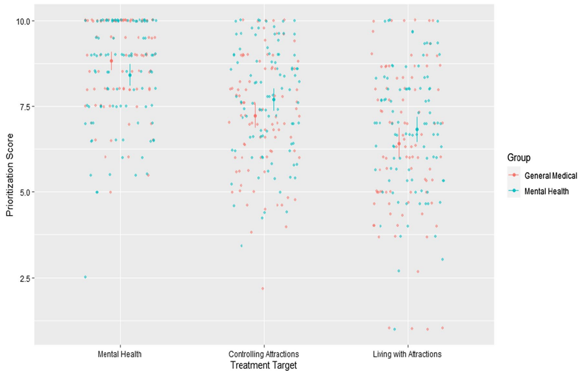
Fig. 1 Treatment target prioritization, by professional group. Individual dots represent raw datapoints. Error bars represent the 95% CI of the mean. Descriptive statistics are provided in Supplementary Materials to preserve the readability of the plot