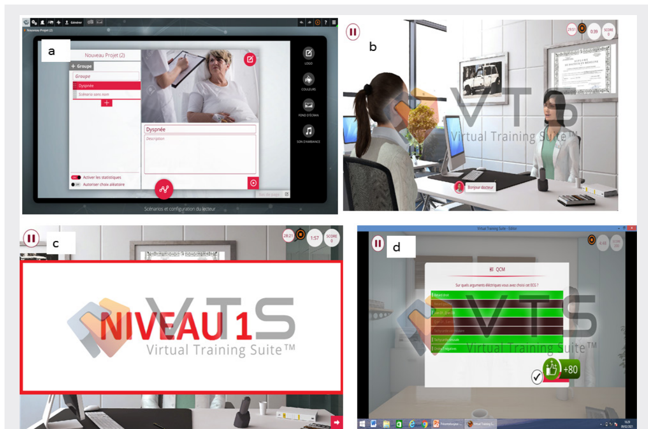
Figure 2 : Some screen casts of the serious game

Each of the team has completed the game design successfully. The game design process has been evaluated. Some screen casts of a serious game designed by students is represented in figure 2.