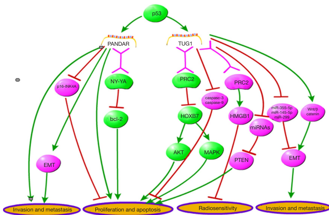
Figure 2 The known functions and mechanisms of two special lung cancer lncRNAs, TUG1 and PANDAR, are demonstrated in this figure. Green lines stand for the molecular interaction specific for lung carcinoma, while red lines stand for the common pathways that mediate the action of TUG1 and PANDAR in other cancers. These two lncRNAs function as cancer inhibitors in lung carcinoma. The unique cancer-inhibiting functions of TUG1 and PANDAR are both mediated by RNA binding proteins, and regulated by p53 in lung cancer, while their p53-dependent anti-tumor mechanism has not been reported to be involved in other malignancies.

it has been reported that PANDAR expression is positively correlated with advanced stages and poor prognosis in bladder cancer. Suppression of this lncRNA decreased invasion and metastasis, and increased apoptosis in bladder cancer cells (143). Additionally, it has been reported that PANDAR is upregulated and it facilitates cell proliferation in breast cancer. Knockdown of PANDAR inhibits G1/S transition of breast cancer cells via suppressing p16 INK4A (144). In gastric cancer, it has been demonstrated that PANDAR was highly expressed in cancerous tissues, which is positively correlated to tumor size, lymph node burden and lower survival rates (145). Moreover, Wu et al. has showed an early-stage diagnosis value of circulating PANDAR in clear cell renal cell carcinoma (146). The expression profile and function of PANDAR is completely different in lung carcinoma from other cancers mentioned above, although it is consistently upregulated in cancer and functions as a cancer promoter in most malignancies. Han et al. reported that PANDAR exhibited a downregulated expression level in lung cancer