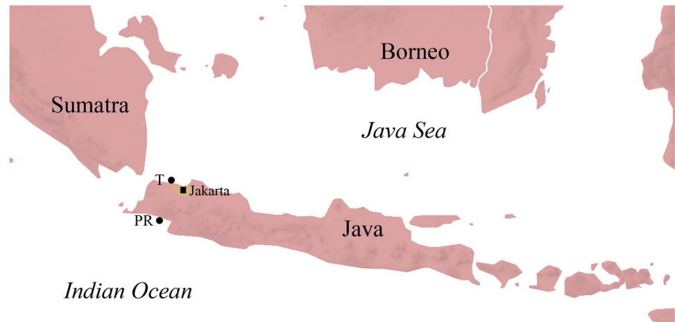
Fig. 1 Map of study area on Java, Indonesia. Samples were collected from fish markets in Pelabuhan Ratu (PR) and Tangerang (T). Map according to Koepper et al. (2021)