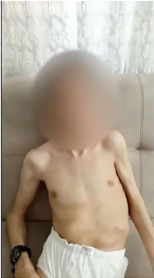
Video 1. Segment 1. Case 2 showed generalized dystonia with severe kyphoscoliosis, left hand clenching, and diffuse muscle atrophy. Segment 2. Case 2's brother (Case 3) presented with tiptoe walking on the left foot, with eversion aggravated by walking, and severe kyphoscoliosis. Segment 3. Case 4 showed kyphoscoliosis and acral dystonia with mild dystonic hand tremor. Segment 4. Case 17 (Table 1) showed tiptoe walking, which worsens with fatigue, particularly on the left. 3 Segment 5. Case 17's sister (Case 18; Table 1) showed a dystonic-spastic syndrome, mainly affecting the left hemibody. 3 Video content can be viewed at https://onlinelibrary.wiley.com/doi/10.1002/mdc3.13398

walking (Video 1). Lower-limb hyperreflexia and kyphoscoliosis were also detected. His cognitive functions were normal, and he graduated from university.