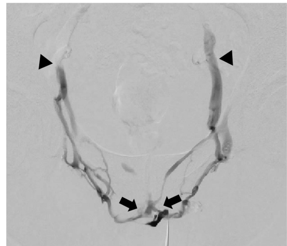
Fig. 3 Venogram post anterograde access via deep dorsal penile vein confirming venous leakage via bilateral periprostatic veins (arrows) and internal pudendal veins draining into iliohypogastric veins (arrowheads)

In patients with erectile dysfunction due to venous leakage embolization is a minimally-invasive endovascular