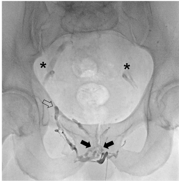
Fig. 4 Radiographic image post venous leakage embolization using N-butyl-2-cyanoacrylate and ethiodized oil mixed in a 1:3 ratio. Note radiopaque embolization material within periprostatic veins (arrows) and internal pudendal vein (open arrow). There is residual contrast staining of both iliohypogastric veins post venogram (asterisk) as also demonstrated in the complementary movie file, not to be mistaken for embolization material. Complementary movie file demonstrating venous embolization performed with a slow but steady injection of embolization material under Valsalva maneuver and continuous fluoroscopic monitoring

treatment option. Technical success rates are reported to be as high as 97% and complications rates are low (5%), including mainly minor complications whereas major complications such as pulmonary embolism are very rare (< 1%) (Doppalapudi et al., 2019). As reported in the literature, the average overall clinical success rate is 60% (range 22–100%) including various techniques and both partial and full responses (Doppalapudi et al., 2019; Fernandez Arjona et al., 2001; Rebonato et al., 2014; Peskircioglu et al., 2000). For full response, meaning sufficient erection to perform intercourse without additional need for supportive vasoactive medications, success rates rather tend to be within the lower range of the spectrum so far (Kutlu & Soylu, 2009). Durability of successful treatment was reported up to 22 months post embolization (Doppalapudi et al., 2019). However, small patient collectives on the one hand as well as inhomogeneous study protocols and various embolization techniques on the other hand may impede study reproducibility. Furthermore, long-term results are still pending. In conclusion, increasing future use of computed tomography cavernosography as routine approach in patients with suspected venous leak on color Doppler flow analysis for adequate patient selection and treatment planning as well as use of anterograde embolization techniques among endovascular interventionalists may contribute to patient health and ameliorated study results.