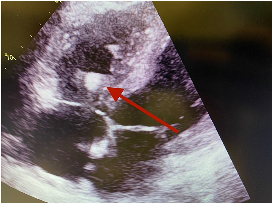
FIGURE 2: Echocardiogram showing intracardiac thrombus in right ventricle on subcostal view