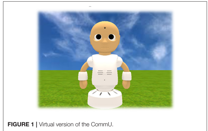
FIGURE 1 | Virtual version of the CommU.

The virtual robot used in this study was a virtual version of a humanoid robot called CommU (36–38) (Figure 1; Vstone Co., Ltd.). CommU has 14 DoFs as follows: waist (2), left shoulder (2), right shoulder (2), neck (3), eyes (3), eyelids (1), and lips