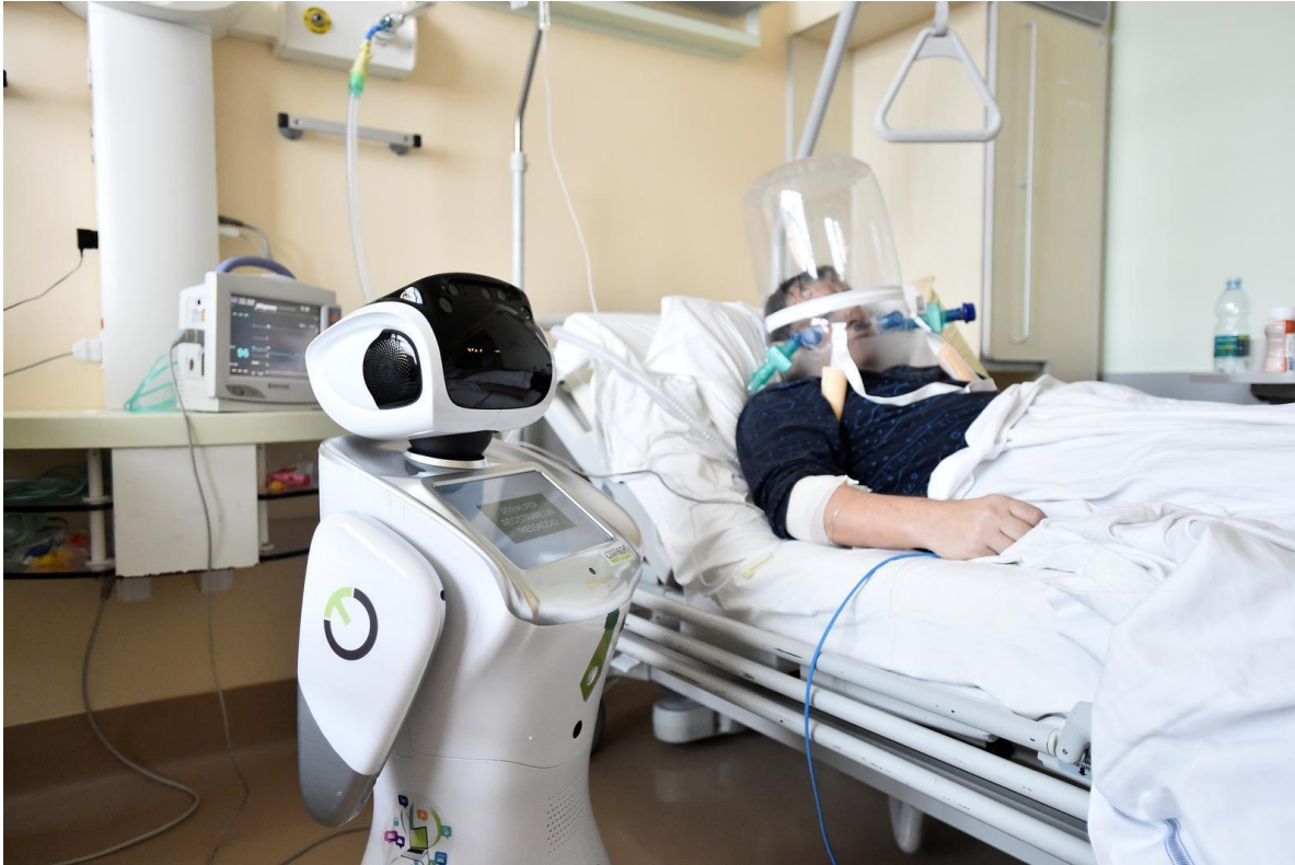
Fig. 1: Tommy, the robot nurse, helps keep flesh-and-blood doctors and nurses safe from coronavirus at the Circolo Hospital in Varese, Italy (7, 8)

and medical device images, improve diagnoses and outcomes, as well as a helpful role in accelerating health research activities.