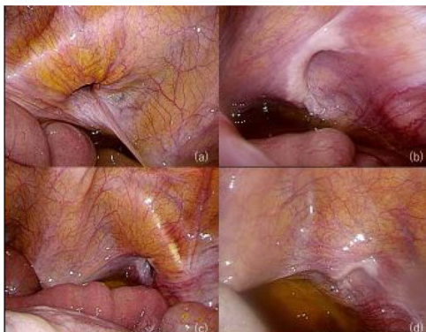
Figure 2. Laparoscopic view of the mesh placement; (a) right OH; (b) after repairing the right OH; (c) left OH; (d) after repairing the left OH.

The patient was placed in the supine position under general anesthesia and the surgery was performed. A 12-mm-sized trocar was inserted into the abdominal cavity through an open incision on the umbilicus, and the intra-abdominal pressure was 6 mmHg. The intra-abdominal pressure was set at a lower pressure than usual. A 5-mm-sized trocar was inserted from the left flank and the head of the patient was lowered. Laparoscopic examination revealed bilateral OH and there was no evidence of ischemia or necrosis in the small intestine. Pneumoperitoneum was temporarily discontinued, and the right OH was repaired by the modified Kugel herniorrhaphy. Laparoscopy confirmed that the direct Kugel patch was placed at the appropriate position. Subsequently, the left OH was repaired similarly (Fig. 2). The operation time was 175 min, pneumoperitoneum time was 15 min and the volume of blood loss was 10 g. The patient recovered without post-operative complications.