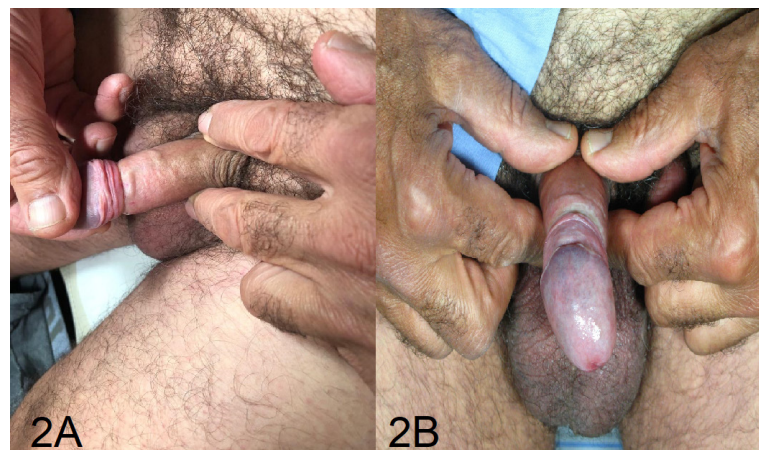
Figure 2. Penile Lichen Sclerosis Before (a) and After (b) Treatment.

patient tolerated the treatment well, and he did not report any side effects.