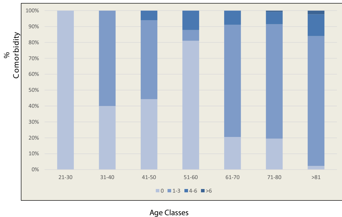
Fig. 2 Analysis of percentages of comorbidities 1–3, 4–6, > 6, according different age classes (years)

heart failure agents and statins. As regards to osteoporosis, de-prescribing of vitamin D/bisphosphonate was frequently performed not because of drug interactions, but aiming to improve compliance to antiviral therapy in patients on polytherapy, sometimes following the Beers criteria, as well [34].