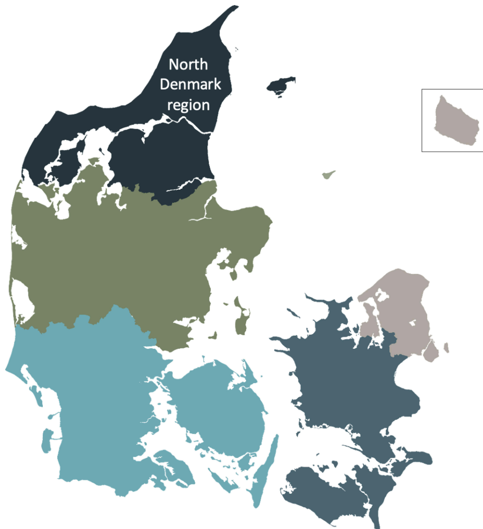
Figure 1 A map of the Denmark. The North Denmark Region is marked with black.

Medical care is tax-supported and free of charge for all residents in Denmark. A unique civil registration number is assigned at birth, which allows for a unique identification of all Danish residents and an unambiguous linkage of individuals between registries. 10 In the North Denmark Region, an outpatient clinic for patients with long-COVID was established on January 1, 2021 at Aalborg University Hospital (Figure 1). The catchment population was 590,439 (January 1, 2021) and 21,727 had tested positive for SARS-CoV-2 in the North Denmark Region during the study period. 14,15 Patients eligible for consultation at the hospital outpatient clinic were required to have had symptoms for >6 weeks and a previous SARS-CoV-2 infection documented by a positive polymerase chain reaction (PCR) test on a respiratory sample or a positive serum antibody test. In addition, all patients admitted with acute COVID-19 infection requiring oxygen treatment were invited to a follow-up examination at Aalborg University Hospital.