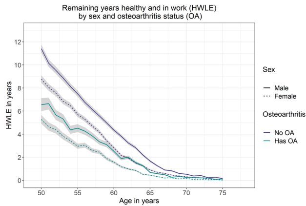
Figure 3. Plot of remaining years expected to be spent healthy and in work (HWLE) by sex and osteoarthritis (OA) status at ages 50–75 with 95% confidence intervals (ELSA data). Sex is indicated by line type (male: solid line; female: dashed line) and osteoarthritis status is indicated by colour (no OA: purple; has OA: green).