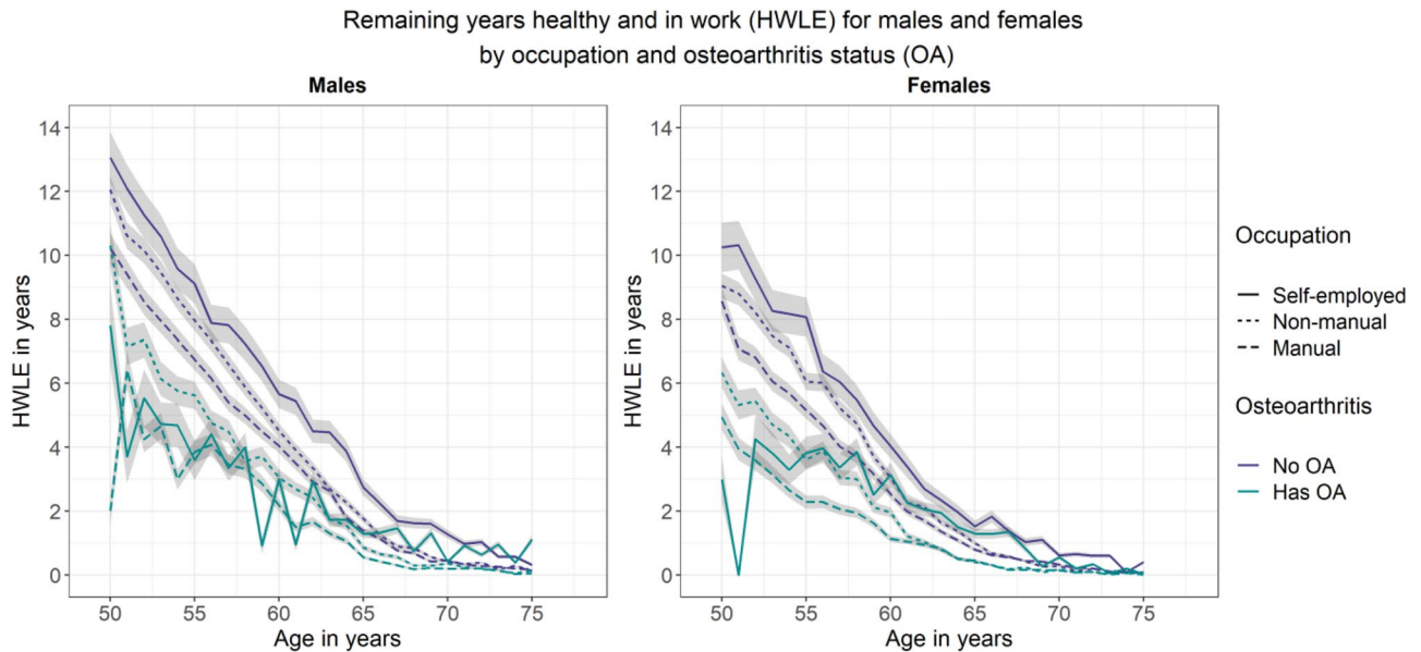
Figure 5. Plot of remaining years expected to be spent healthy and in work (HWLE) by sex, occupation, and osteoarthritis (OA) status at ages 50–75 with 95% confidence intervals (ELSA data, n = 15,284 ). Occupation type is indicated by line type (self-employed: solid line; non-manual: short dashed line; manual: long dashed line) and osteoarthritis status is indicated by colour (no OA: purple; has OA: green).

LE; without osteoarthritis: 8.77 [8.45, 9.09] years which was 26.7% of LE). This ordering was similar for HWLE at all ages from 50–75 (Fig. 3, Table 1).