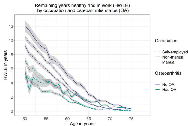
Figure 4. Plot of remaining years expected to be spent healthy and in work (HWLE) by occupation and osteoarthritis (OA) status at ages 50–75 with 95% confidence intervals (ELSA data, n = 15,284). Occupation type is indicated by line type (self-employed: solid line; non-manual: short dashed line; manual: long dashed line) and osteoarthritis status is indicated by colour (no OA: purple; has OA: green).