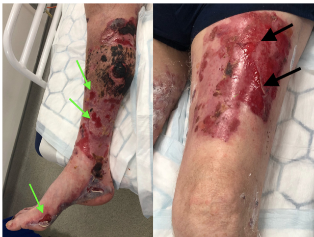
Figure 1. Right lower limb (SSG recipient site) and left thigh (SSG donor site). Various size bullous lesions present on both SSG donor and recipient site one-month post-surgery with tense bullae already deroofed (demonstrated by arrows). Note the patchy graft loss with a small dry necrotic area right medial calf.

Histology demonstrated a subepidermal blister with a moderate eosinophil infiltrate in the dermis and fluid cavity (Figure 2). The direct immunofluorescence showed IgG and C3 along the dermo-epidermal junction, confirming BP. The patient has since been treated with Dermal cream, Dermal soap substitute, Dermovate ointment (to active areas), hydrocortisone cream (to face), a reducing prednisolone regime, and long-term doxycycline 100 mg daily with six-month review. At the time