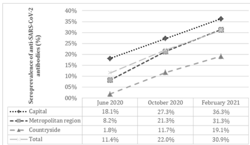
Fig. 1. Univariate analysis of the seroprevalence of anti-SARS-CoV-2 antibodies in the three periods evaluated and according to the blood donation sites. The seroprevalence for the whole group and according to the blood donation sites increased over time, and comparisons by qui-square test showed statistical significance ( p < 0.001 ).

The seroprevalence of antibodies to SARS-CoV-2 was not different for male and female sex in general (22.6% vs. 20.2%; p = 0.144 ), or in each period of blood donation separately, as June 2020 (12.1% vs. 10.7%; p = 0.573 ), October 2020 (23.9% vs. 20.0%; p = 0.177 ) or February 2021 (31.5% vs. 30.1%; p = 0.710 ). On the other hand, the seroprevalence of antibodies to SARS-CoV-2 was lower in population above 50-years old in the first period of this study (June 2020) but showed a gradual increase over the months, reaching 25% of positivity in February 2021, getting a similar rate to other ages (Fig. 2A). The seroprevalence was higher among Afro-descendants than in the Caucasian population in all analyzed periods. Despite the data showing an increase of