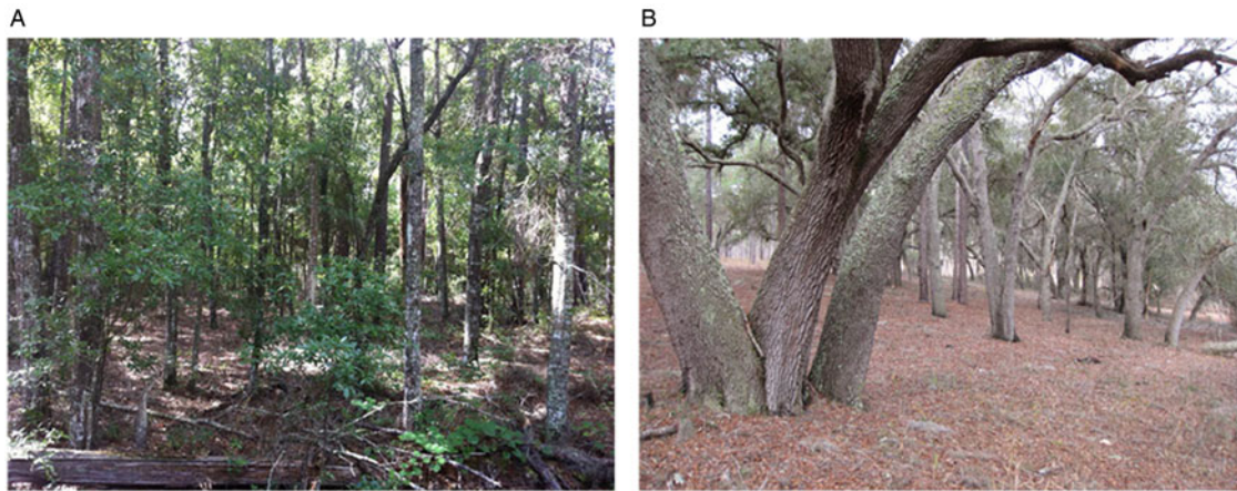
Fig. 1. Habitat types where ticks were collected in OSBS: (A) successional hardwood and (B) xeric hammock.

suggested as a mitigation strategy for ticks, so we also sought to test whether tick behaviour differs between habitats with varying burn history (Davidson et al. , 1994; Willis et al. , 2012; Gleim et al. , 2014). Although extrinsic factors of the environment play a large role in tick-questing behaviour, intrinsic factors such as pathogen infection also influence host-seeking behaviour (Benelli, 2020). However, few studies address the joint effects of habitat type and infection status on questing behaviour in A. americanum .