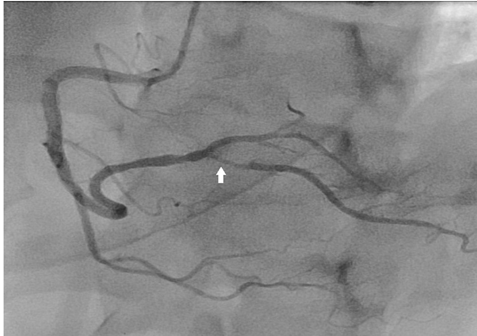
FIGURE 2: Initial angiogram of RCA shows the patent stent in the mid-segment of RCA and severe disease in ostioproximal segment of the right posterior descending artery (arrow).