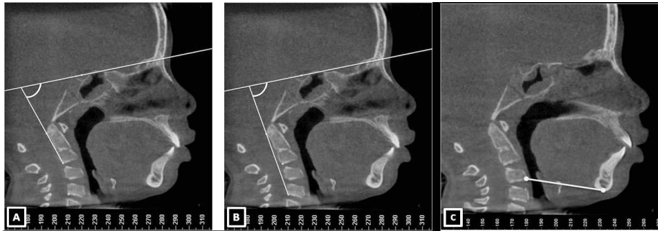
Figure 5. (A) SN.C2s-C2i angle. (B) SN.C2s-C4i angle. (C) Distance between the points and C4i Me.

When the midpalatal suture is subjected to expansion forces, it separates in a nonparallel fashion. Because the maxilla articulates with bones that are not paired, the amount of separation is limited. 17 Silva Filho et al. 18 found that the palatal suture does not follow a parallel opening configuration in the axial plane, with its greatest width toward the anterior area. However, results of this current study show that the observed expansion pattern on the nasal cavity floor does not maintain this pattern of opening. We found the largest significant increase in the transverse middle region of the nasal cavity (1.28 mm) compared with the anterior (1.08 mm) and posterior regions (0.77 mm) when evaluated on the nasal floor in the coronal plane.