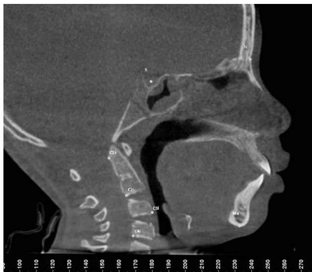
Figure 4. Cephalometric points marked for evaluation of craniocervical positioning and placement of the sagittal jaw.

The benefits of RME on the dimensions of the jaws, nose, and other facial structures have been studied by orthodontists and otorhinolaryngologists. 9-14 Lack of details and superposition of images are the limitations associated with using conventional radiographs to determine the precise anatomic limits of the nasal cavity. 15 Moreover, the accuracy and quality of images obtained by cone-beam computed tomography have led the authors of recent research involving upper airway structures 5,15,16 to choose it as the preferred method.