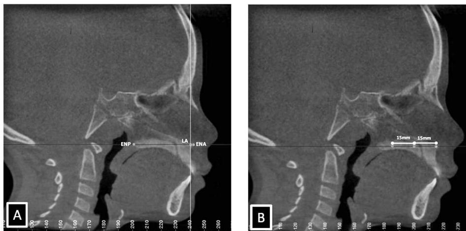
Figure 2. (A) Axial positioning of the palatal plane and determination of the point VA. (B) Determination of the anterior, middle, and posterior nasal cavity.

In the evaluation of the nasal and oropharyngeal space, images were standardized according to the orientation of the position of the skull as described by Palomino-Gómez, 6 such that the images would be positioned the same way at both time points. For evaluation of the nasopharynx, points were located in the posterior nasal spine (PNS), vomer posterior (VP), horizontal extension point VP and vertical extension point ENP (VA), basion (Ba), PPINf (located 15 mm posterior to the lower limit of the uvula), and PAINf (located 15 mm above the lower limit to the uvula)