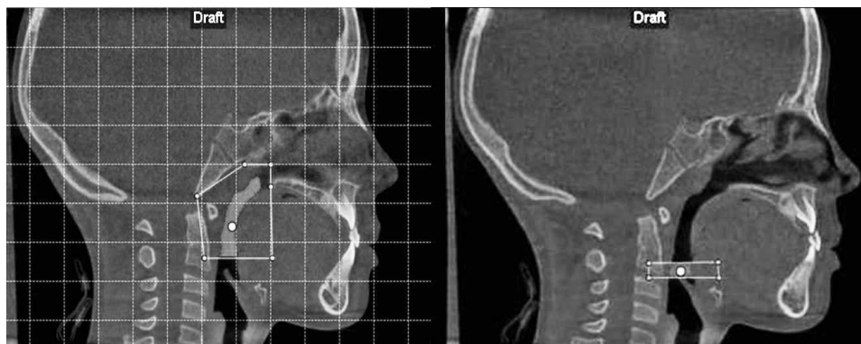
Figure 6. (A) Nasopharynx and (B) oropharynx delimitation.

Zhao et al., 7 who analyzed the same area with CBCT before and 15 months after RME, found no significant differences in the volume of the oropharynx and nasopharynx. They reported that the hypothesis that there is a change in the upper airways after the procedure is not supported. Results of the present study were similar to other findings 19,22 in which no significant changes in the dimensions of the nasopharynx after RME were observed. Usumez et al. 22 evaluated lateral cephalograms of 8 patients after 8 months of the RME procedure and observed increases in the absolute mean values in this region, but they attributed the lack of statistical significance of this variable to the small sample size. Charoenworaluck 19 evaluated the effects of RME