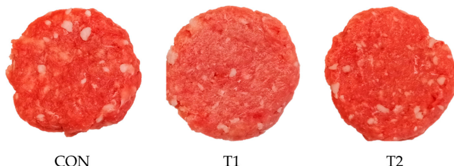
Figure 1. Appearance of pork burgers. CON: control burgers; T1: burgers formulated with walnut and algal oil mixture hydrogel; T2: burgers formulated with pistachio and algal oil mixture hydrogel.

Results in the same row with the same superscripts indicates no significant differences. Sig.: significance: *** ( p < 0.001 ). LC n-3: long-chain omega-3 (sum of EPA, DPA and DHA).