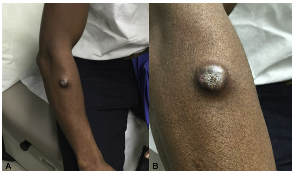
Fig 1. A , Clinical photograph of the indurated pustular nodule with a central, crusted ulcer. B , Closer view of the same image.

evaluation of an abscess on his right forearm. One year before presentation, he had cut his forearm while cleaning a broken fluorescent light bulb. The lacerated area initially healed without cause for concern, but over the following 6 months, the patient noticed that the affected area beneath the involved area began to swell, elicit pain when palpated, and express purulent discharge. In January 2021, he visited a local dermatologist, who cultured the abscess, revealing P boydii species complex. He was then referred to the