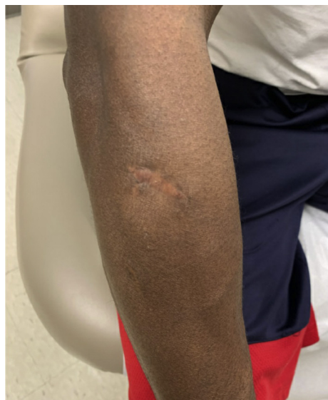
Fig 3. Clinical photograph of the affected area after 3 months of voriconazole therapy with only residual scarring at the site of the prior excision.

Excisional biopsy of the lesion on hematoxylin-eosin–stained histologic sections revealed a predominantly dermal-based nodule (Fig 2, A) composed of multifocal collections of neutrophils (Fig 2, B)