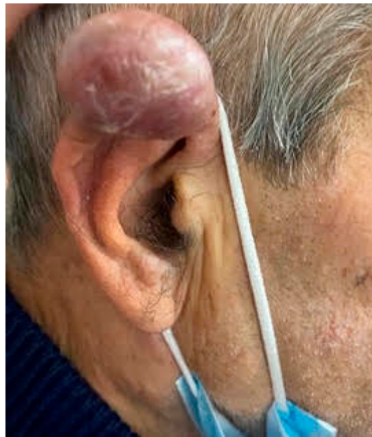
Figure 1. Asymptomatic rapidly growing violaceous nodule on the right helix of the patient.

An incisional biopsy was performed: the histology section showed small roundish blue cells with basophilic nuclei and scarce cytoplasm organized in nests. A high mitotic rate was present and immunohistochemistry showed positivity for CD56 and synaptophysin (Figure 2); thus, the diagnosis of Merkel Cell carcinoma was made.