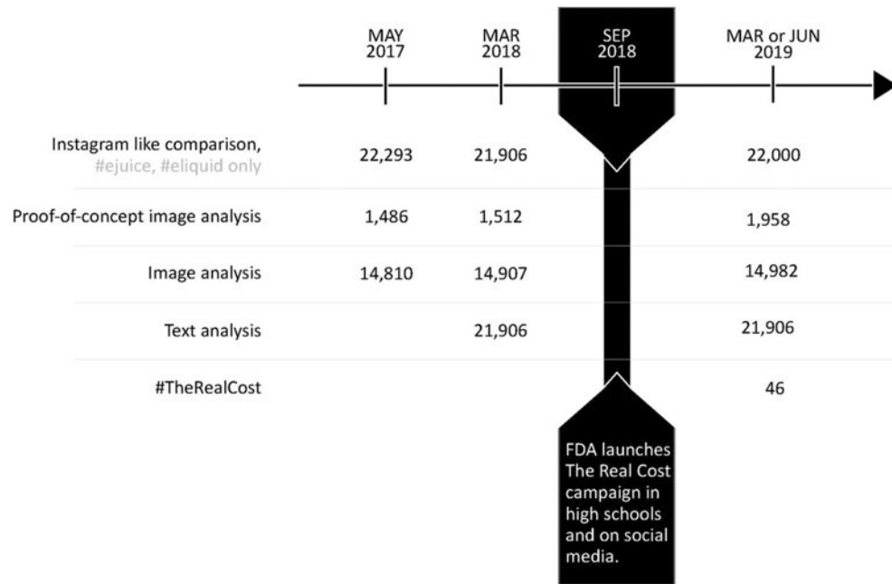
FIGURE 1 | Timeline for the collection of vaping-related Instagram posts.