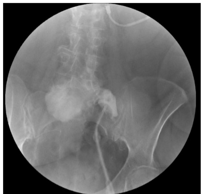
Figure 4 Gastrostomy catheter in situ with guidewire removed.

Nausea and vomiting are common symptoms experienced by patients with advanced cancer and they can be triggered by a variety of aetiologies, including malignant bowel obstruction. These symptoms may be distressing and can be notoriously difficult to control in some patients, leading to significant morbidity and an impaired quality of life. 1 The management of these symptoms in patients with advanced cancer