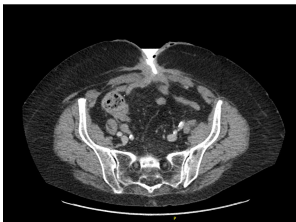
Figure 6 Axial CT image demonstrating oral contrast traversing the proximal jejunum and exiting via the gastrostomy catheter as expected.

This case demonstrates the successful long-term control of refractory vomiting in a patient with intermittent small bowel obstruction secondary to a widespread intra-abdominal malignancy. She suffered from intractable nausea and vomiting following closure of an enterocutaneous fistula, with small bowel obstruction occurring at the level of this fistula site. Despite having a disseminated intraperitoneal malignancy, the slow growing nature of this cancer indicated the patient had a favourable life expectancy. This presented a management challenge for our team as the patient's intractable symptoms needed to be controlled, ideally without compromising her life expectancy or quality of life. After careful evaluation by the surgical team, it was deemed that the extent of the patient's disease and comorbidities rendered an