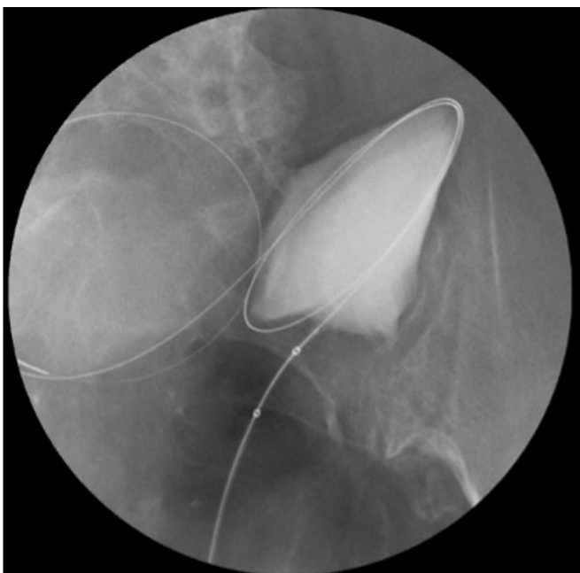
Figure 2 Gastrostomy catheter insertion into small bowel with enhancing loop of bowel demonstrated.

A subsequent CT abdomen with oral contrast confirmed the tube was appropriately sited, entering the lower midline abdominal wall with its tip within a proximal to mid jejunal loop (figure 6). It was successfully draining oral contrast.