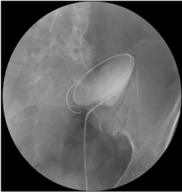
Figure 1 Fluoroscopic image of endoscopic guidewire being inserted into small bowel loop through enterocutaneous fistula.

a 20 Fr Capsule Monarch tube, which is more ideal as it does not require a balloon to remain in situ and has a shorter length (figure 5). This enabled excellent symptomatic benefit with resolution of the vomiting.