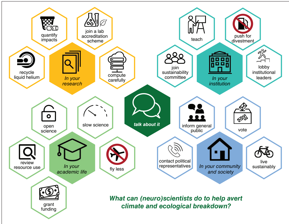
Figure 1. Ways in which (neuro)scientists can act on the climate and ecological emergencies. We distinguish four areas of influence and a non-exhaustive list of specific actions, each of which is discussed in greater detail in the article.