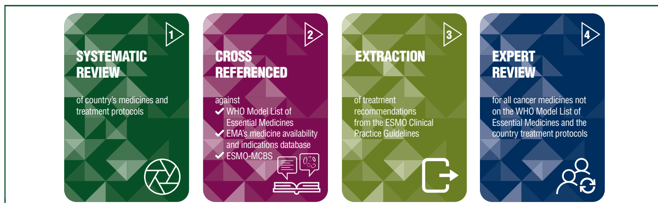
Figure 1. ESMO four-phase approach to prioritise cancer systemic therapies.

To continue offering patients quality cancer care, the Kazakhstan Ministry of Health requested an impact mission in 2016, led by the World Health Organization (WHO) along with the International Atomic Energy Agency and the International Agency for Research on Cancer. 2 The objective was to assess national cancer services and to provide recommendations for how services can be maintained and access increased over time. The situational analysis revealed rapidly increasing budgetary expenditure on cancer treatment, particularly driven by increasing total amounts spent on systemic therapy. 2