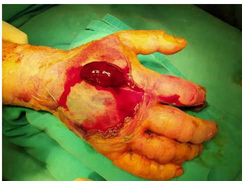
Figure 3. Hematoma along with fluid drained during the decompression.