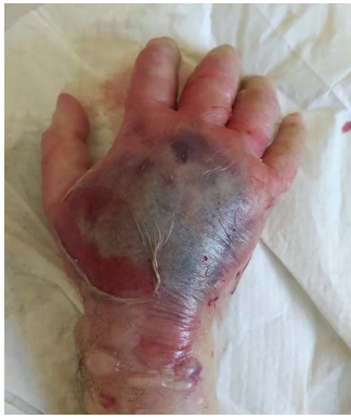
Figure 1. Swollen, paleness, erythematous and tense hand with skin blistering on dorsal aspect following extravasation of iodinated contrast agent.

hypothenar area (radial to the first metacarpal and ulnar to the fifth metacarpal, respectively) were made so as to reduce the pressure of the aforementioned compartments. Volar interosseous ( \times 3 ) were also released. Digits' compartments were additionally decompressed via ulnar longitudinal incision of each finger. Subsequently, the carpal tunnel ligament was dissected through a palmar longitudinal incision and the median nerve was decompressed. Finally, the increased forearm pressure of volar, dorsal and mobile wad (lateral) compartments was also relieved.