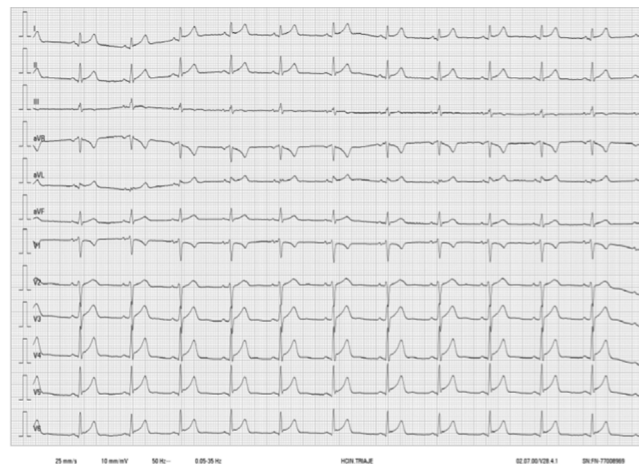
Figure 1. Electrocardiogram showing sinus rhythm with a diffuse concave ST segment elevation (> 1 mm) and a PR segment elevation in lead aVR.

In summary, we report the first clinical case of acute myocarditis after the third dose of BNT162b2 vaccine, with a benign clinical course and no complications. It is advisable to investigate this diagnosis in patients with compatible symptoms after the third dose of BNT162b2, even if no adverse reactions occurred with previous doses.