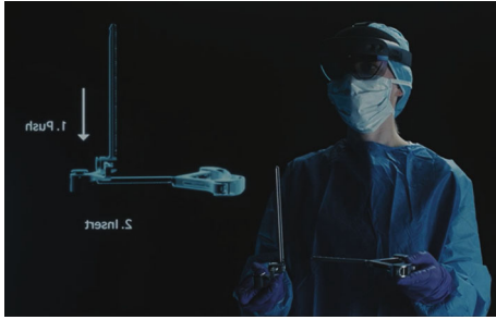
FIGURE 1: The HoloLens 2 mixed-reality headset is used in visual instrumentation setup in this example of using a holographic display.