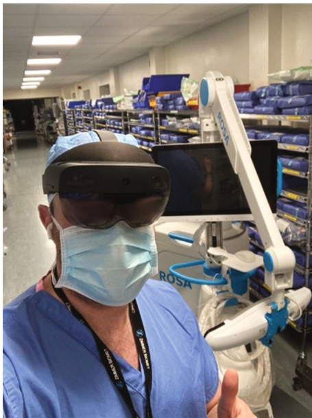
FIGURE 5: Example of the HoloLens 2 in use by a product manager at a distant location.

HoloLens 2 (Microsoft, WA, USA) was used. It is an advanced video communication tool that enables hands-free collaboration with remote experts in real time. In wearing a HoloLens 2, the user can share a real-time view of the environment with remote collaborators eliminating the need for them to be on site (Figure 4). With tools such as annotation, ability to move virtual documents to the real world, and ability to deploy across multiple devices, these advanced features enable more effective on-demand collaboration. Further, the telesurgical setting allows for mobile, real-time, intraoperative views.