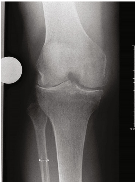
FIGURE 2: Preoperative radiographs showing the anteroposterior view of the right knee.