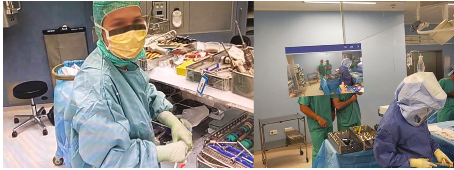
FIGURE 4: Examples of the product manager's view of a remote operating room through the HoloLens worn by the surgeon.