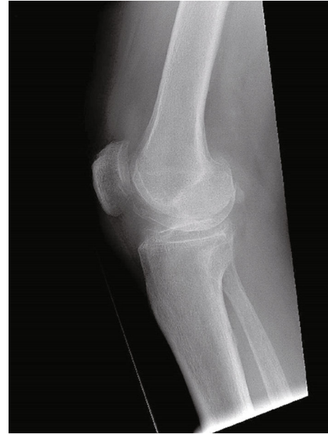
FIGURE 3: Preoperative radiographs showing the lateral view of the right knee.

Privacy is of the utmost concern when it comes to both patients and healthcare professionals. The HoloLens 2 Privacy and Data Protection information notes that the device contains both network and operating system securities with data protection [6]. The data protection includes the use of Azure integration which encrypts the data traveling through the cloud with the use of transport layer security. Azure documentation demonstrates compliance with ISO/IEC 27001, 27017, and 27018 amongst others.