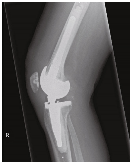
FIGURE 7: Postoperative radiographs showing the lateral view of the right knee.

senior author reports no other interruptions in the surgical workflow with the use of the MR headset.