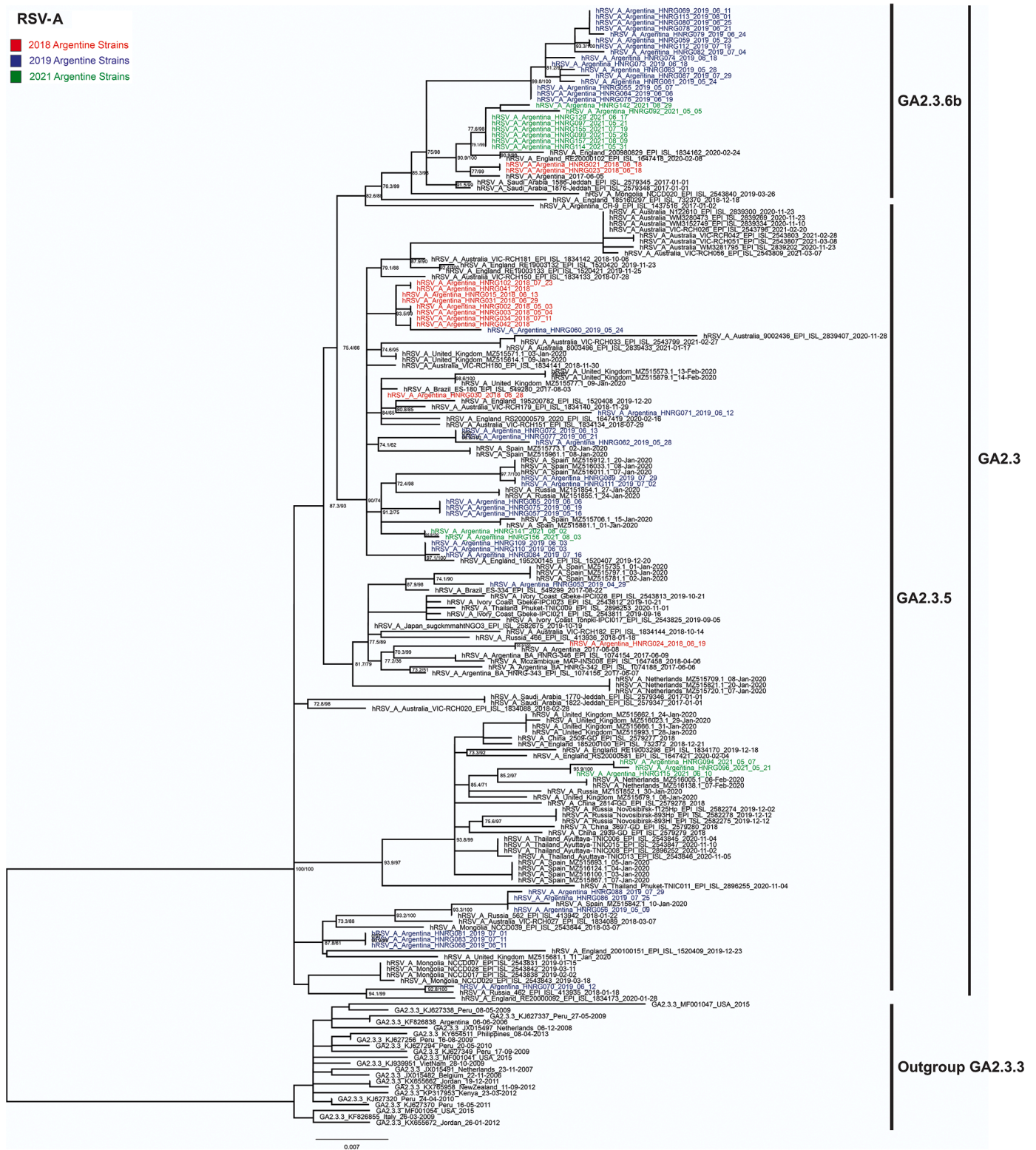
Fig. 2. Maximum Likelihood phylogenetic analysis of RSV-A. Argentine sequences from 2018 to 2021 were analysed with sequences from the same period downloaded from GISAID and GenBank databases. Argentine sequences are highlighted in colours according to the year. The genotypes are indicated on the right. The model established by IQTREE was GTR + F + G4. Nodes supports: SH-aLRT support (%) /ultrafast bootstrap support (%) (1000 replicates each). Only supports over 70/70 are shown.

patients with ALRTI showed the same seasonal pattern as the one that was seen during the last decade (2). A total of 253 RSV-positive cases were detected in 2018 with peaks in July and 215 in 2019 with peaks in June (Fig. 1). Surprisingly, in 2020 no hospitalisations due to RSV were