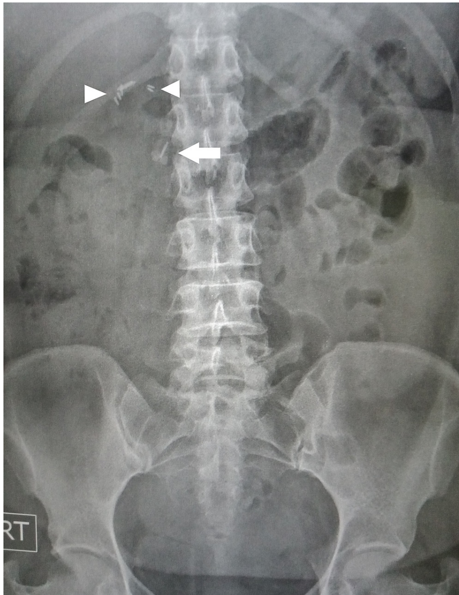
FIGURE 1: Abdominal X-ray showing surgical clips at level of T12/L1 (arrowheads) and another clip at L1/L2 (arrow).

Abdominal X-ray showing surgical clips at level of T12/L1 (arrowheads) and another clip at L1/L2 (arrow).