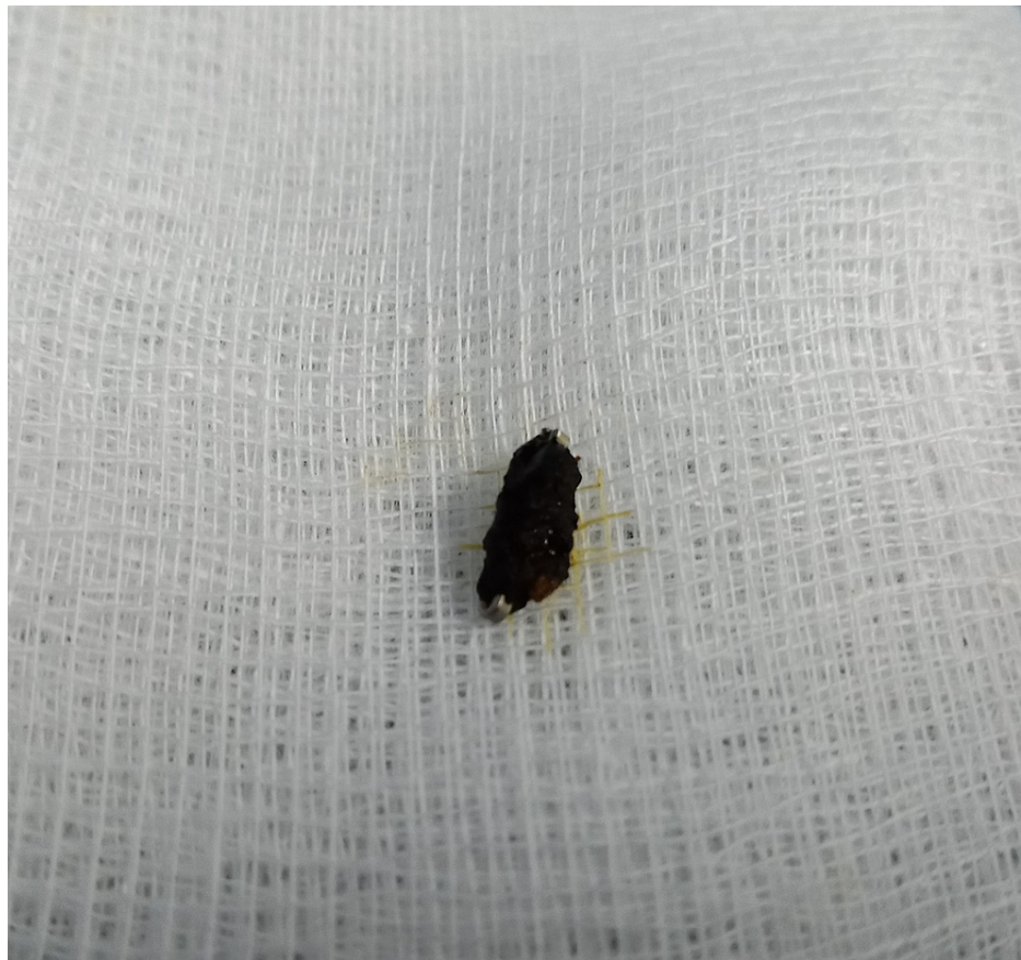
FIGURE 3: Extracted fragment of black pigment stone with surgical clip at the center.