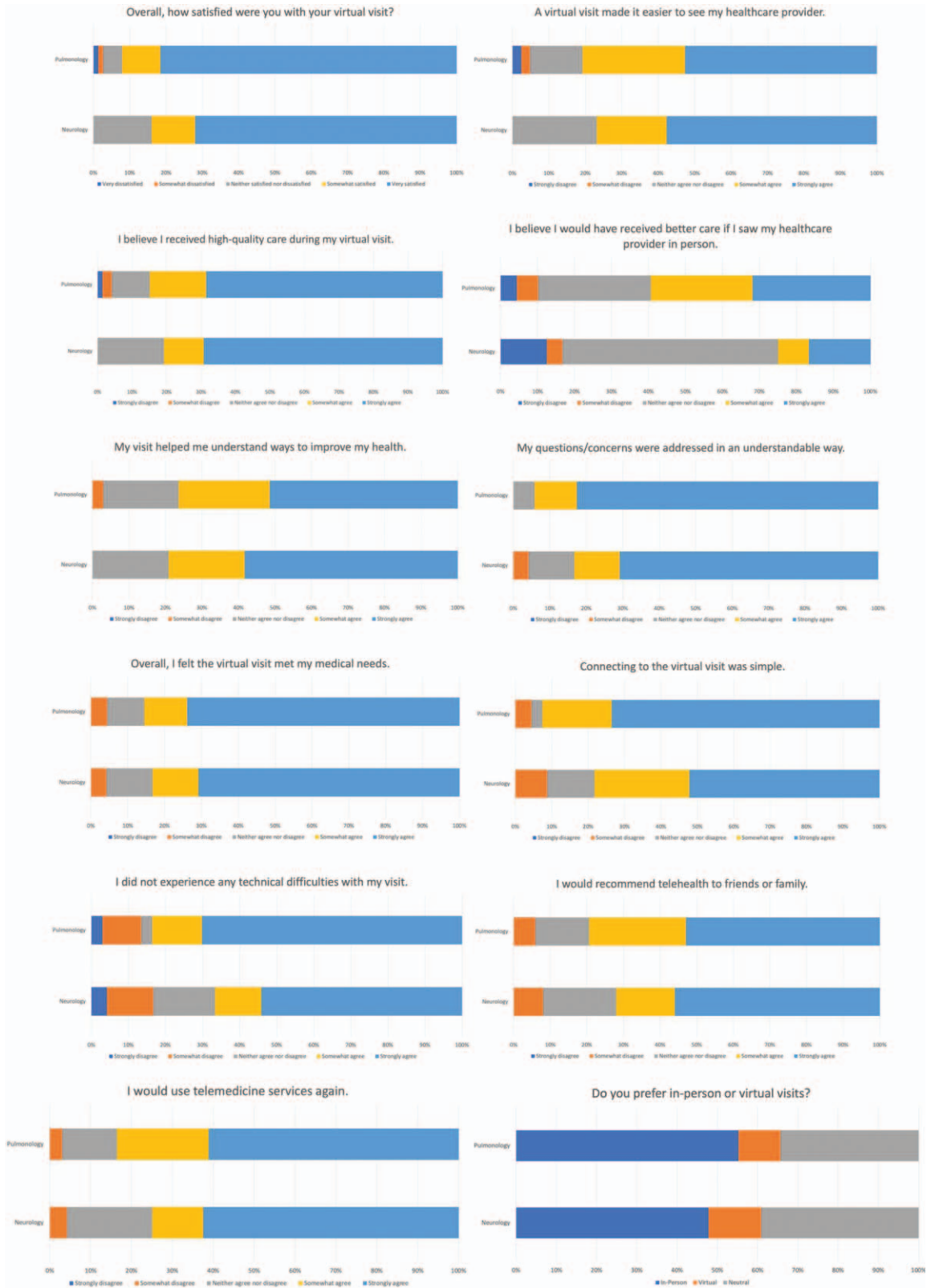
Figure 1. Survey responses.