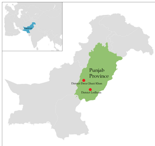
Fig. 2. Map of Pakistan with highlighted Punjab Province and Lodhran and Dera Ghazi Khan districts. Map was generated in the Datawrapper 1.25 web tool (Datawrapper GmbH, https://app.datawrapper.de/ ) and modified in GIMP 2.10 software (GIMP Development Team, https://www.gimp.org/ ).

tionary history was inferred using the Maximum Likelihood method with Kimura 2-parameter model (Kimura, 1980). The tree was scaled based and the length of branches and evolutionary distances was expressed in the same units. Datasets of sequences obtained from GenBank and those generated in this study were trimmed to have similar length of all sequences.