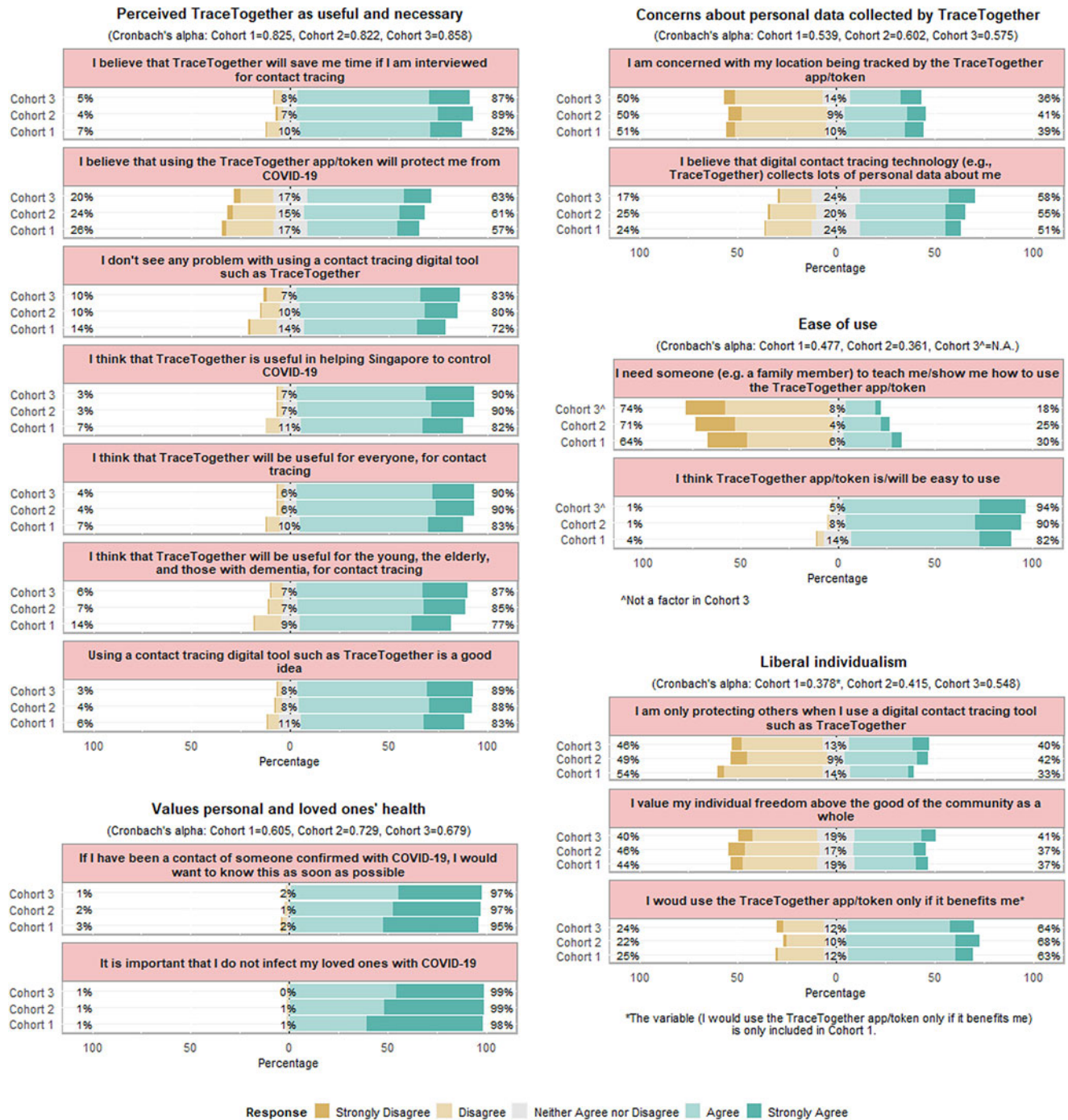
Fig. 1. Anchored divergent plot of factors influencing the acceptance and adoption of TraceTogether during the COVID-19 pandemic. The dataset was stratified into three cohorts based on the time when significant policy interventions were introduced to increase the adoption of TraceTogether. Cohort 1 corresponds to responses collected from July 2020 to October 2020, cohort 2 from November 2020 to December 2020 and cohort 3 from January 2021 to December 2021.

([cohort] AOR (95% CI) [1] 2.77 (2.29–3.34); [2] 2.04 (1.61–2.58); [3] 2.30 (1.62–3.25)). Those with ‘Concerns about personal data collected by TraceTogether’ had lower likelihood of accepting TraceTogether ([cohort] AOR (95% CI) [1] 0.68 (0.60–0.78); [2] 0.62 (0.52–0.75); [3] 0.53 (0.40–0.70)). Only respondents in cohort 1 who ‘valued their personal and loved ones’ health during the COVID-19 pandemic’ had slightly higher likelihood of being willing to use TraceTogether. Individualistic notions do not have a