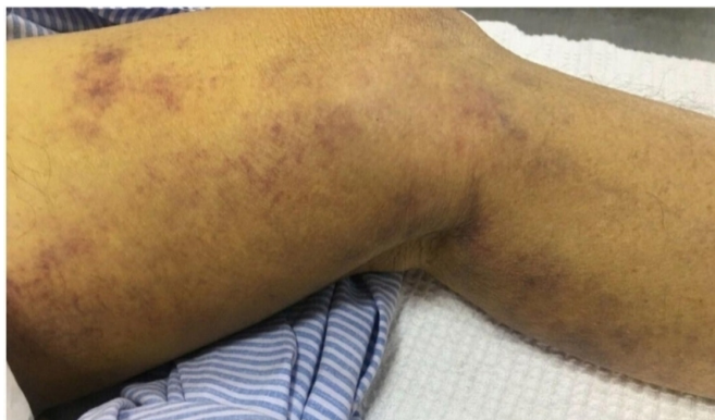
Figure 2 Ecchymosis over the left thigh with intramuscular haematoma.

Drug-induced bleeding is unlikely. Although on aspirin, he was not on any anticoagulants, including unfractionated heparin or direct thrombin inhibitors. An antiphospholipid antibody syndrome was unlikely due to his age, and this typically presents with thrombosis. There was no personal or family history of haemostatic disease. There were no features of connective tissue disease. Furthermore, he had a normal platelet count and