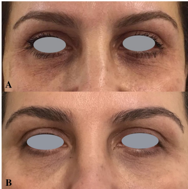
Fig. 2 Improvement of periorbital wrinkles: (a) before treatment; (b) 1 year after last treatment