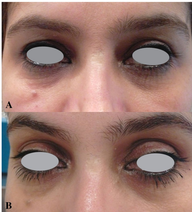
Fig. 3 Improvement of periorbital wrinkles: (a) before treatment; (b) 1 year after last treatment