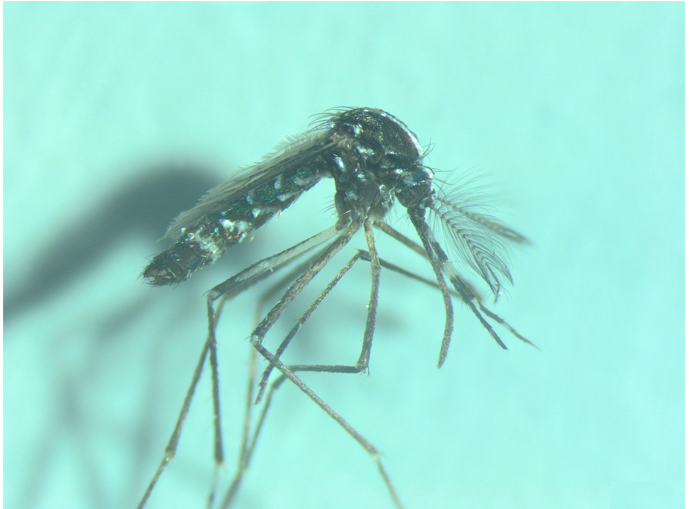
Fig 2. First specimen of Aedes albopictus caught in Zhur st.1, date 23.07.2020.

https://doi.org/10.1371/journal.pone.0264300.g002