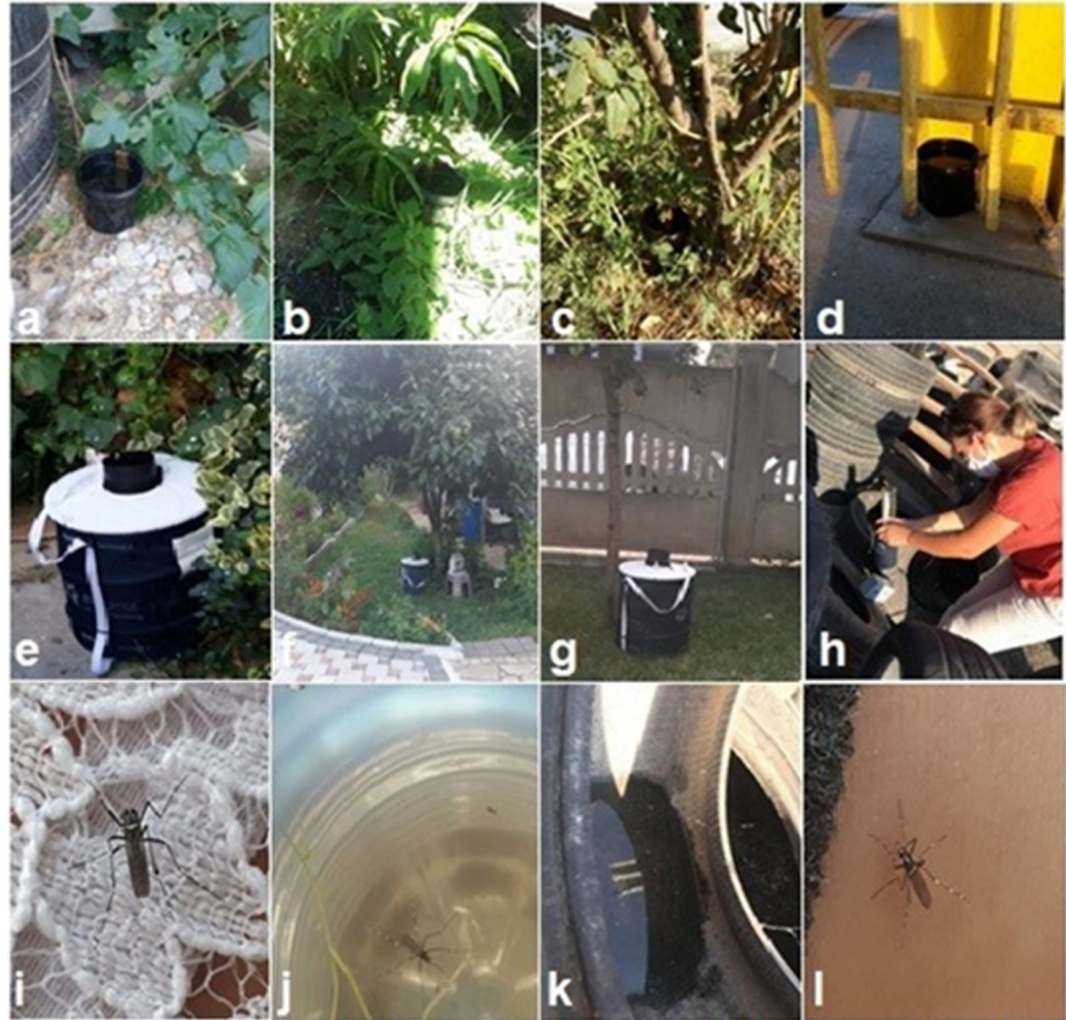
Fig 1. Examples of traps operating at several mosquito collection sites. Ovitrap in: a Vlashnje (Tyrecentres); b Zhur st.1 (Privat residence garden); c Prizren (Privat residence garden); d Vërmicë (Restaurant veranda); e Odour-baited adult traps (BG-Sentinel) Vermice (Restaurant garden); f Zhur st.1 (Resident garden); g Prizren (Resident garden). Catching with aspirator: h Vlashnje (Tyrecentres). Adults resting in: i Prizren (on the human body); j Zhur (Plastic bottle); k Vlashnje (Inside the tire, resting on the surface water); l Zhur st.1 (first specimen of Aedes albopictus caught while landing on human body).

https://doi.org/10.1371/journal.pone.0264300.g001