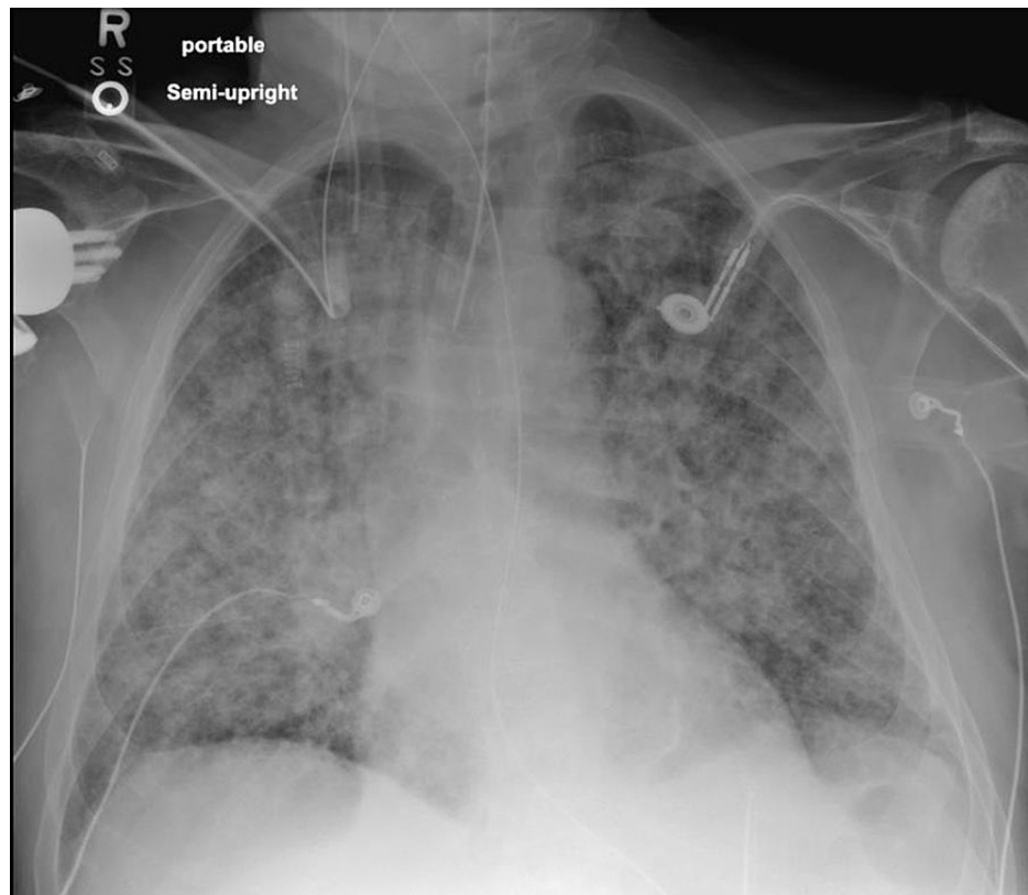
FIGURE 2: Chest x-ray showing diffuse bilateral pulmonary opacities suggesting the development of ARDS

ARDS: acute respiratory distress syndrome