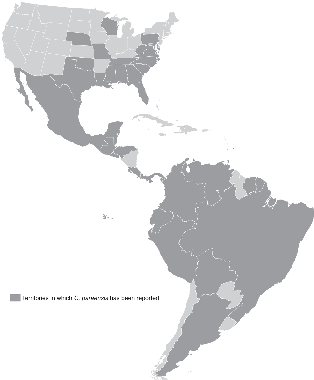
Fig. 2 Distribution of Culicoides paraensis in the Americas. Dark gray indicates countries and states where C. paraensis has been reported 61,96–101 . Map template modified from ref. 102 .

a three-month period. Over one million mosquitoes were captured, and a significant number of new viruses were isolated. While only one strain of OROV was isolated, there were high annual rates of OROV antibody-positive birds and NHPs during the flooding period, creating suitable ecological conditions for transmission. Prevalence rates were between 2 and 7.1% for