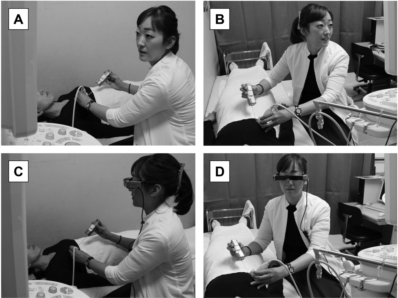
Figure 2. Technical advantage of optical see-through head-mounted displays (OST-HMD) assisted needle biopsy for breast tumor: In conventional ultrasound-guided procedures, needle biopsy is performed while maintaining a posture facing the monitor of a fixed ultrasonic device, which restricts the doctor's posture and movement (A, B). However, with this technique, CNB can be executed smoothly with no posture restrictions (C, D).

Using this procedure, the Moverio BT-35E is used as an OST-HMD device and CNB is implemented under direct vision via the gap at the bottom of the display with ultrasound images on the OST-HMD display worn on the head. Conventional ultrasound-guided CNB is problematic because it restricts the doctor's posture and movements due to the need to perform the procedure while maintaining their posture toward fixed ultrasound equipment. However, with this procedure, even if the head is moved for OST-HMD, the procedure is secured on a safe monitor with the projected image, and CNB can be executed smoothly without posture restrictions. Therefore, the procedure can be performed without the use of restricted postures, even in a limited biopsy space such as an examination room, and even a training surgeon can practice the appropriate procedures without stress.