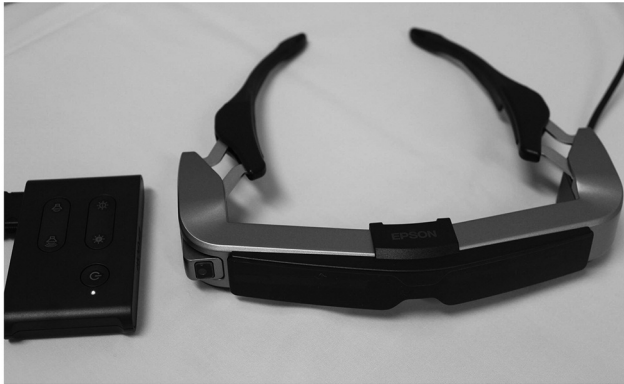
Figure 1. Optical see-through head-mounted displays (OST-HMD) device: Moverio BT-35E (Seiko Epson Corp., Nagano, Japan) was used as the OST-HMD device.