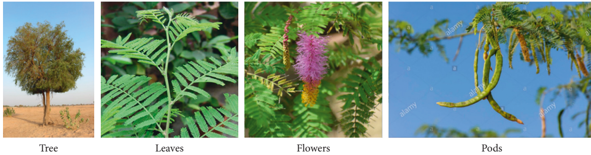
FIGURE 1: Prosopis cineraria tree, leaves, flowers, and pods [7].