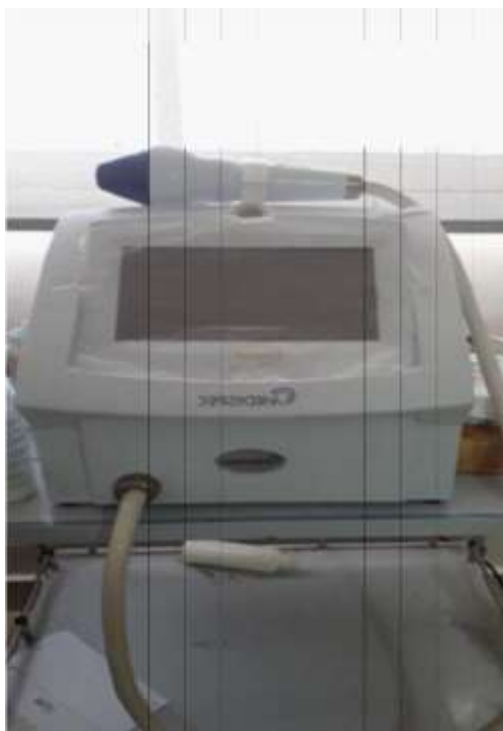
Figure 2: picture of the shockwave machine used for this study

None of the patients reported any pain or adverse events during the treatment and follow up period.