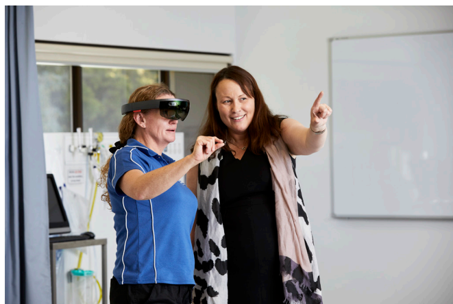
Figure 3 Using MR in class.

At the conclusion of the tutorial participants were asked to complete a 14-item questionnaire (box 1) which included demographic information and open-ended questions which explored the participants learning experience using Microsoft HoloLens, including their opinions with regards to the potential for