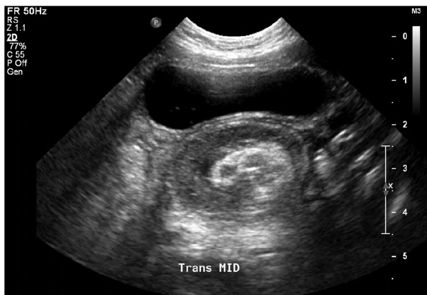
FIGURE 2 “Doughnut sign” posterior to the bladder likely represents bowel within bowel, which is a classic finding for intussusception

widespread immune activation seen in COVID-19 may likely result in such lymphoid hyperplasia and hypertrophy of Peyer's patches, which initiates the suspected pathophysiology of intussusception described previously. 6 Based on the postulated pathogenesis of intussusception and the likelihood that COVID-19 directly affects the GI tract more in children than adults, it is not surprising that intussusception is a possible presentation or complication of SARS-CoV-2 infection.