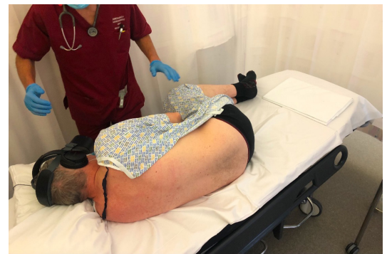
Figure 2 Patient in left lateral position using the virtual reality headset and headphones.

The VR system that was chosen was a Healthy Mind (Paris, France) Pico device with headphones. The immersive scene within the software includes a three-dimensional